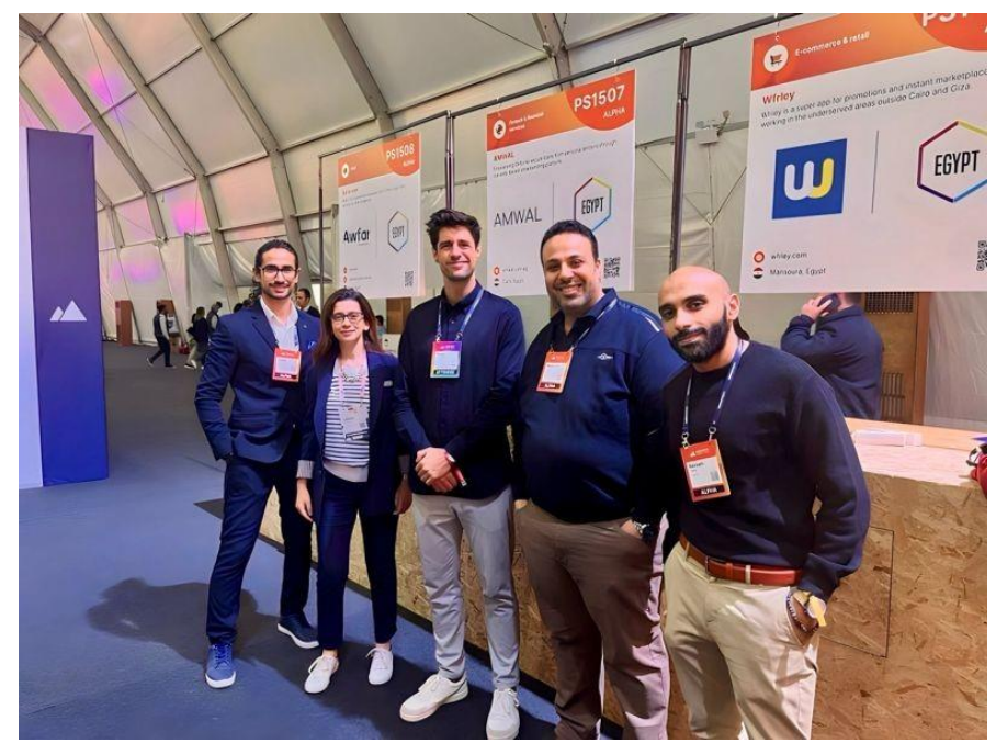
Egyptian founders showcasing tech solutions at Web Summit 2023.

An annual fixture on ITIDA's calendar – and indeed the calendars of global tech giants, innovative entrepreneurs, and investors alike – was of course Web Summit 2023. Held in sunny Portugal, Egypt's ICT, GBS, BPO, and startup industries took center stage at the unforgettable edition of the event. Not only did ITIDA represent Egypt with a country pavilion, designed as a one-stop-shop for business leaders to delve into the country's endless opportunities, but we also took the chance to spotlight an excellent array of local startups and entrepreneurs on a global stage. Founders from an impressive 33 Egyptian startups had the 'Startup Island' buzzing, as they showcased their innovative companies and, by extension, the massive potential of young, Egyptian talents.