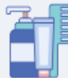
Appliances, articles and products for personal care