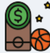
Games of chance