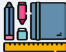
Books & stationery