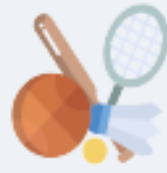
Recreational and sporting services