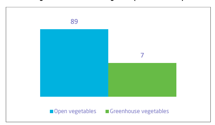
Figure 1. Cultivated area of vegetables (thousand hectares)

As for greenhouse vegetables, the area of vegetables cultivated inside greenhouses in the Kingdom reached 7 thousand hectares, distributed over more than 121 thousand greenhouses, with a production of 721 thousand tons. The results of the comprehensive agricultural survey also showed that the tomato crop ranked first in terms of the number and area of greenhouses in the Kingdom, accounting for 36.7% of the total area of greenhouses, with a production quantity of 300 thousand tons, (Figure 1)